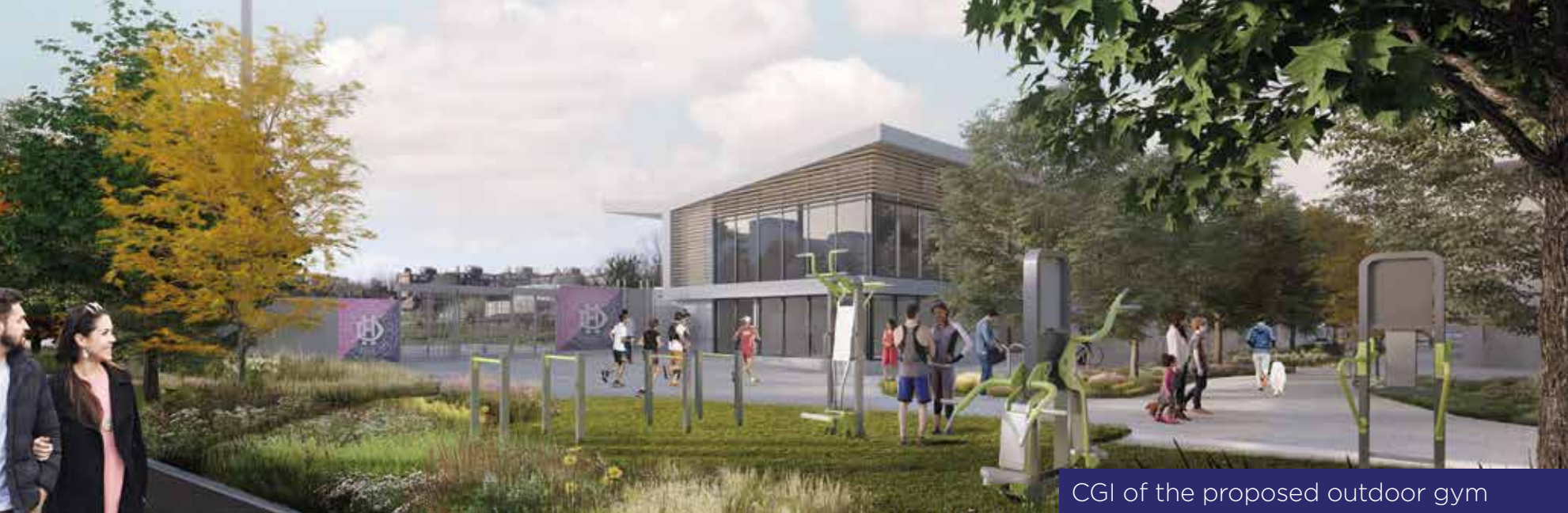
CGI of the proposed outdoor gym